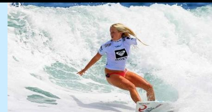
Bethany Hamilton, inspiration behind Soul Surfer .

Wondering what Youth Group is up to in September? Check out what's coming down the pipeline: September 4th -Youth Group Holiday (Labor Day) September 11th - "Life of a Soul Surfer" (Ya' Dig? Discussion) September 17th -Freedom Festival (fundraiser) September 25th - Community Service TBA NOTE: Middle School 4:00 and High School 6:00